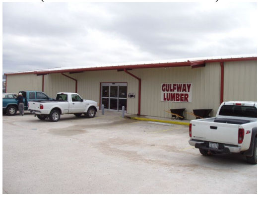
WDS 12 (Warehouse Discount Store)