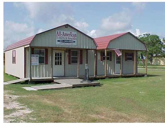
Retail Store 10