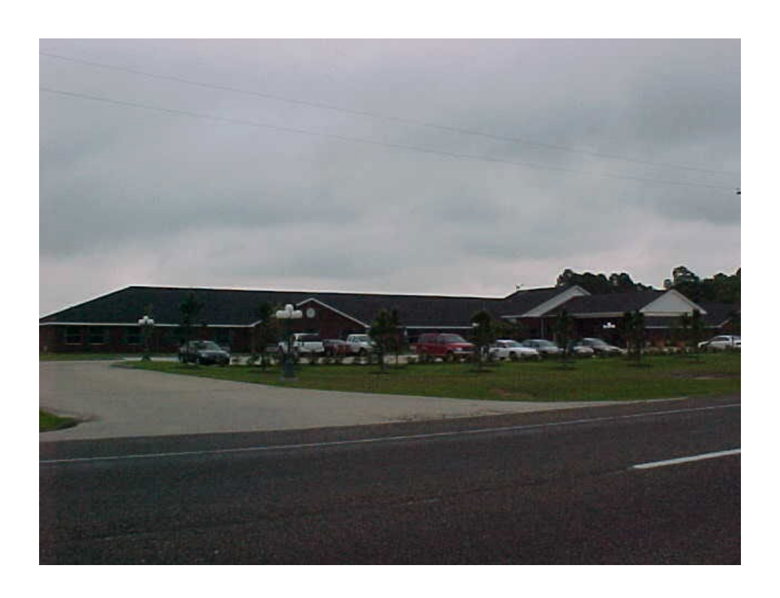
Rest Home 11